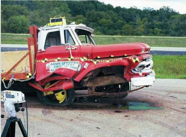
7-ton vehicle driving at 48 km/h destroyed after impact with 3 bollards (under supervision of US State Department)