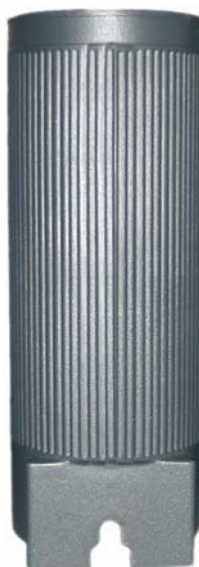
Acropole bollard head